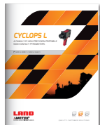
CYCLOPS L PORTABLE PYROMETERS

SEE OUR OTHER RELATED LITERATURE FOR THE CYCLOPS L: